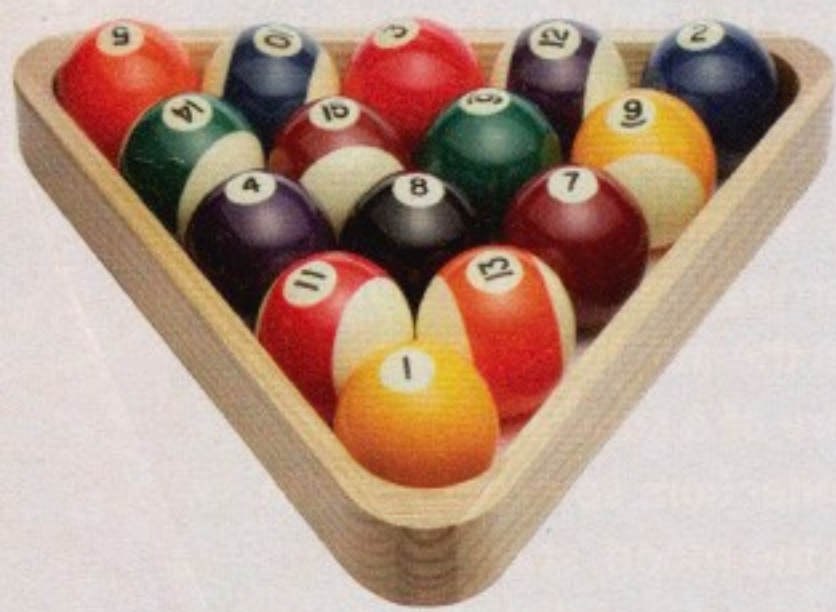
Behind the eight ball, he's bummin'.